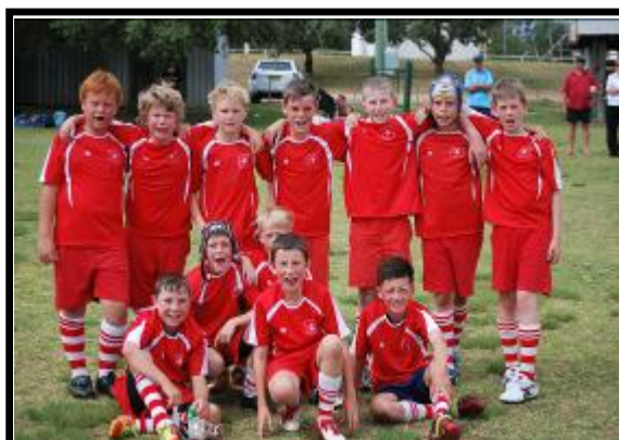
The South Red team; great sports who had great fun and who will be a formidable force in the 2014 Miners' Cup.