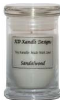
Metro Jar with Lid