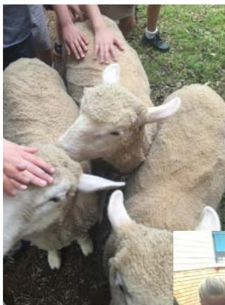
2J farewelling the lambs