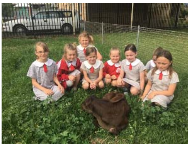
2J girls with Comet