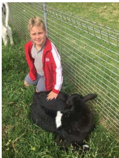
Darcy with Bolt