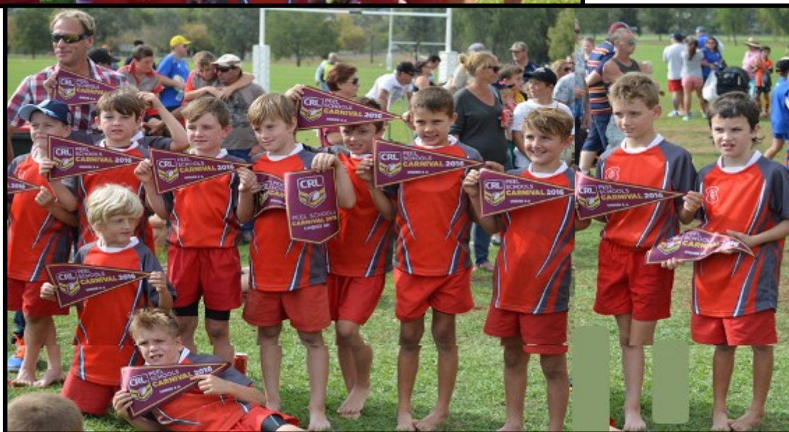
10 Yrs Rugby League side.

2016 Peel Schools Rugby League Carnival Champions.