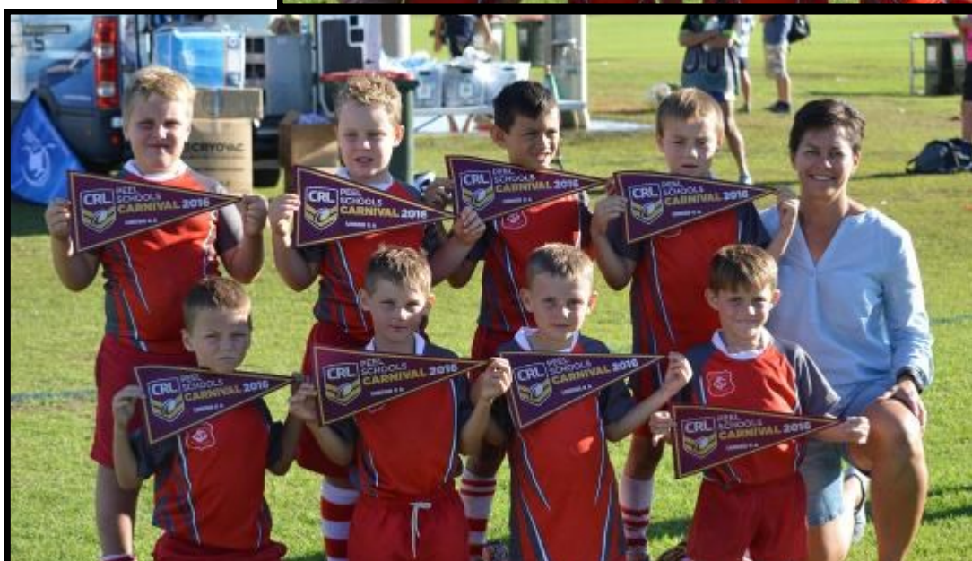
8 Yrs Rugby League side.