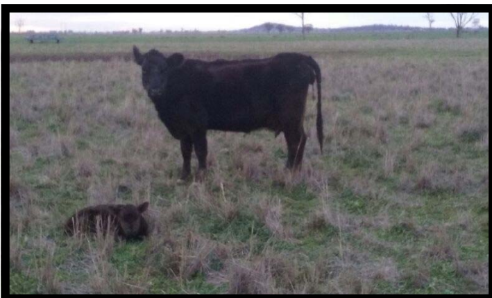
Leigh and her calf