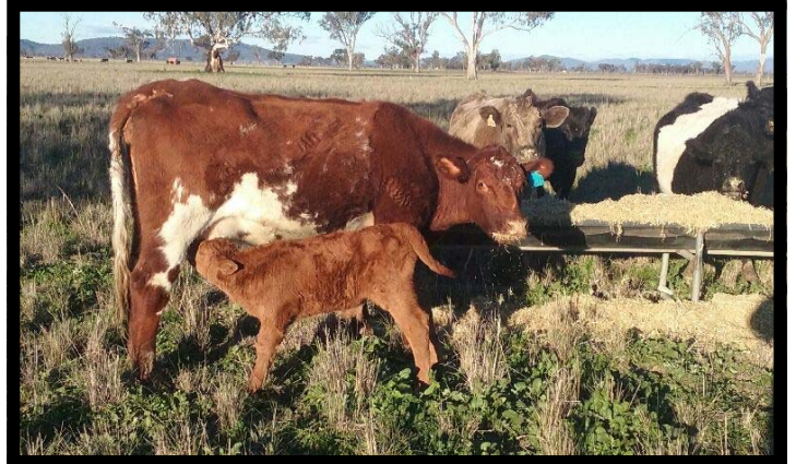
Tucker and her calf