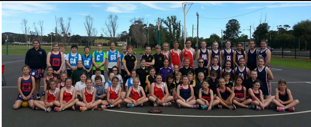
Anne Singleton Cup